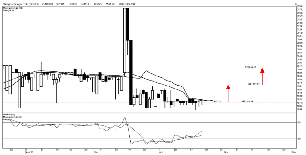
Kinerja saham SGRO